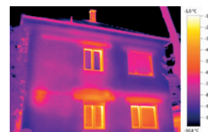
Thermal image with ScaleAssist